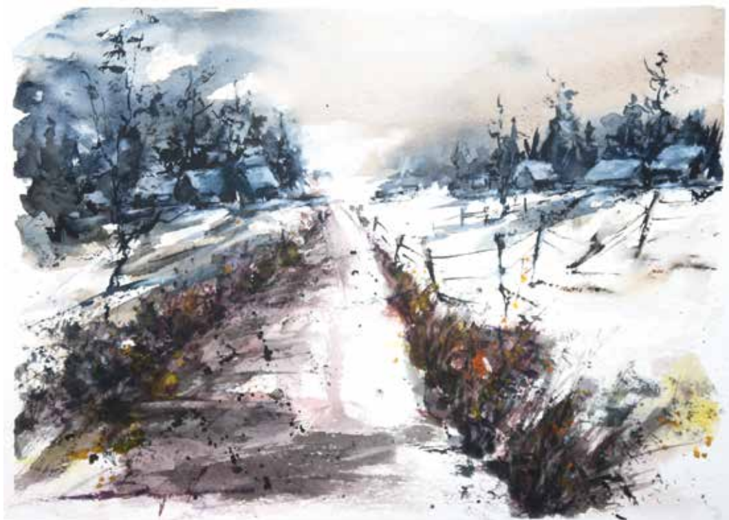
Drago Hajdarovič , Slovenia Pot, 2024, 21 x 29 cm