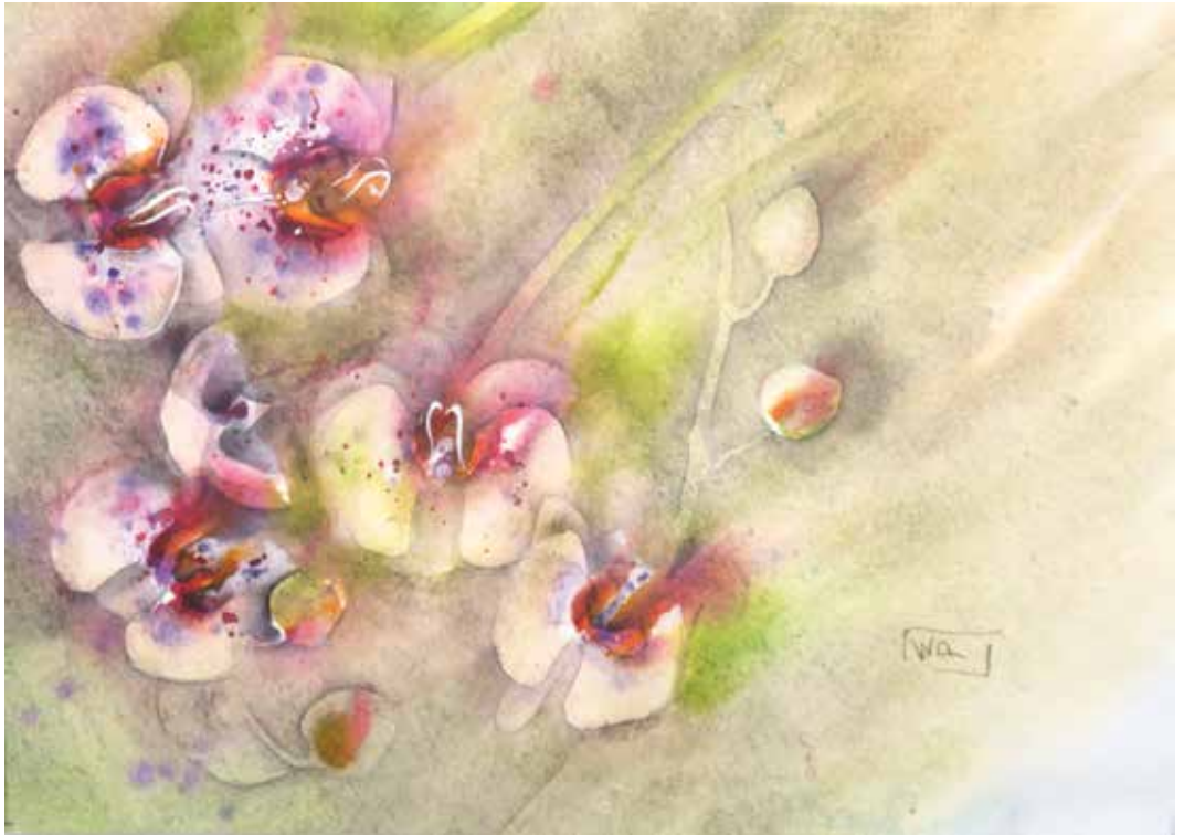
Marisa Pietraperzia , Italy Orchid 4, 2024, 21 x 29,7 cm