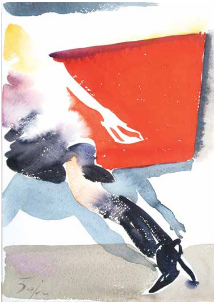
Jože Šajn , Slovenia Beg, 2022, 33 x 23 cm