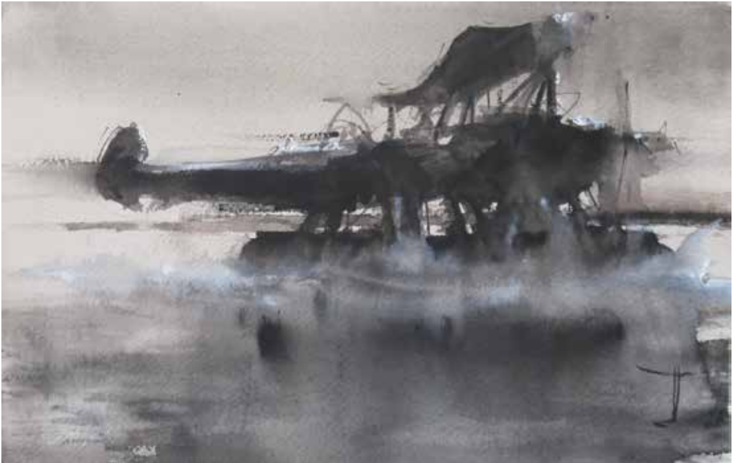
Carlos Perez Lopez , Spain Landing on the river , 2024, 19 x 28 cm