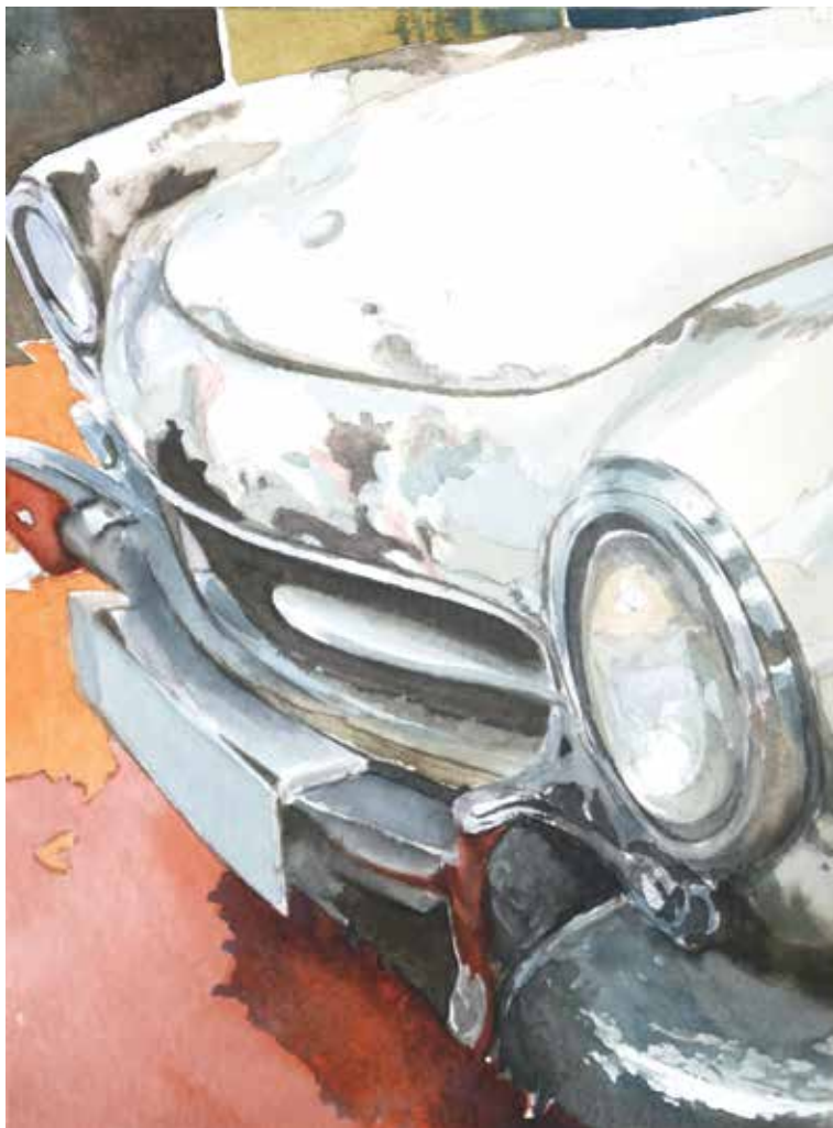
Leszek Błażewicz , Poland I wonder if it can be, 2024, 27 x 20 cm