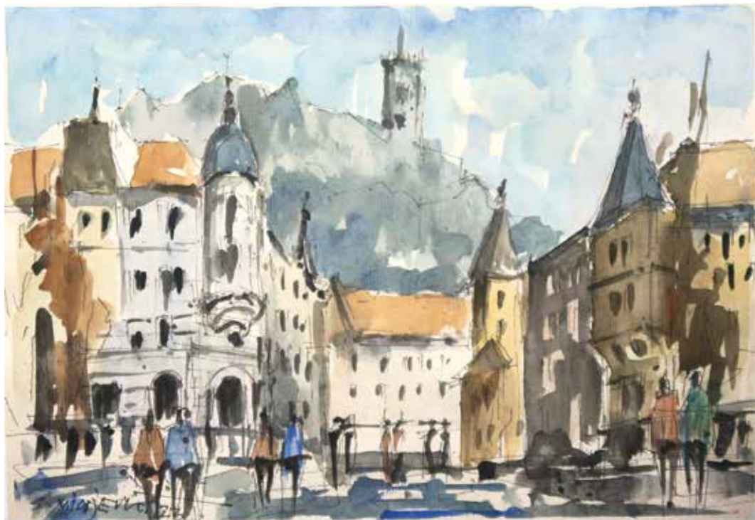
Slobodan Milojević , Slovenia Ljubljana, 2023, 21 x 29,5 cm