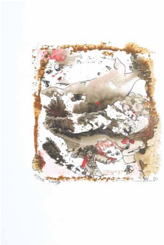
Kara Kalajžič , Slovenia Njene sanje, 2024, 29,7 x 21 cm