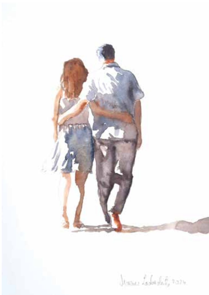
Momčilo Dabanović , Serbia Sunny Day 2, 2024, 29,7 x 21 cm